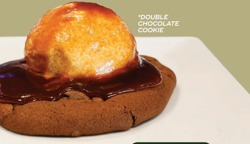
*DOUBLE CHOCOLATE COOKIE

A massive sharable dessert. Our fresh house baked pretzels smothered in butter & topped with a heavy dusting of cinnamon sugar then served with a side of classic salted caramel. This can be the dessert for your entire table, or just you on a fun night out. 8